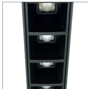
PREMIUM1 UGR<19 lens