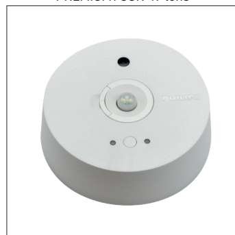
MCS wireless daylight&occ sensor